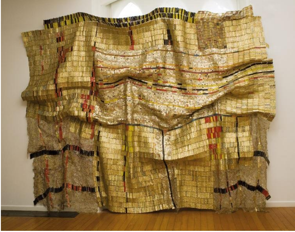
Ghanaian Duvor (Communal Cloth) by El Anatsui