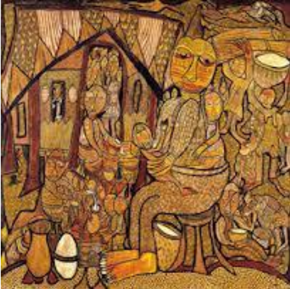
Healing of Abiko Children by Twins Seven-Seven