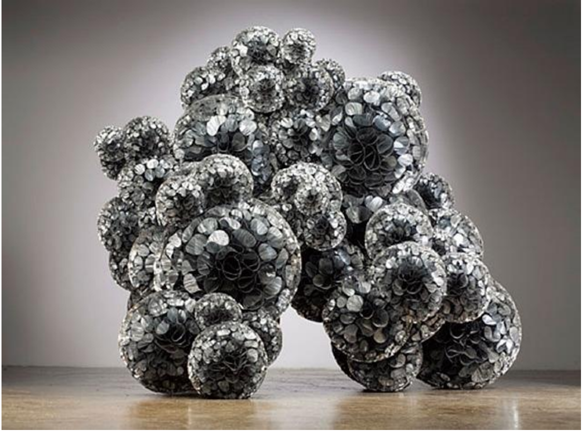
Milar by Tara Donovan