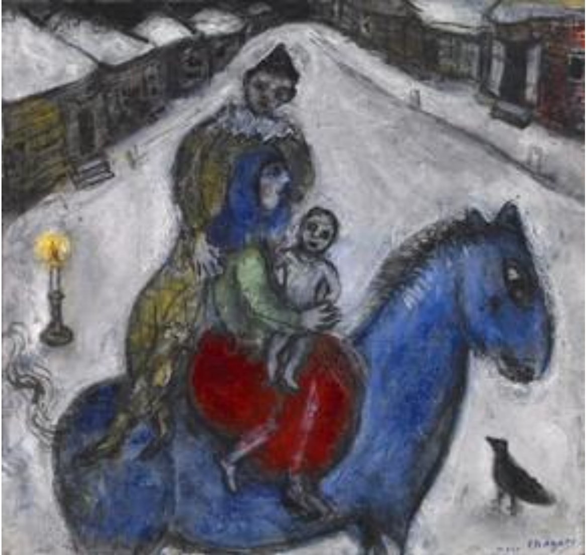
Flight into Egypt by Marc Chagall