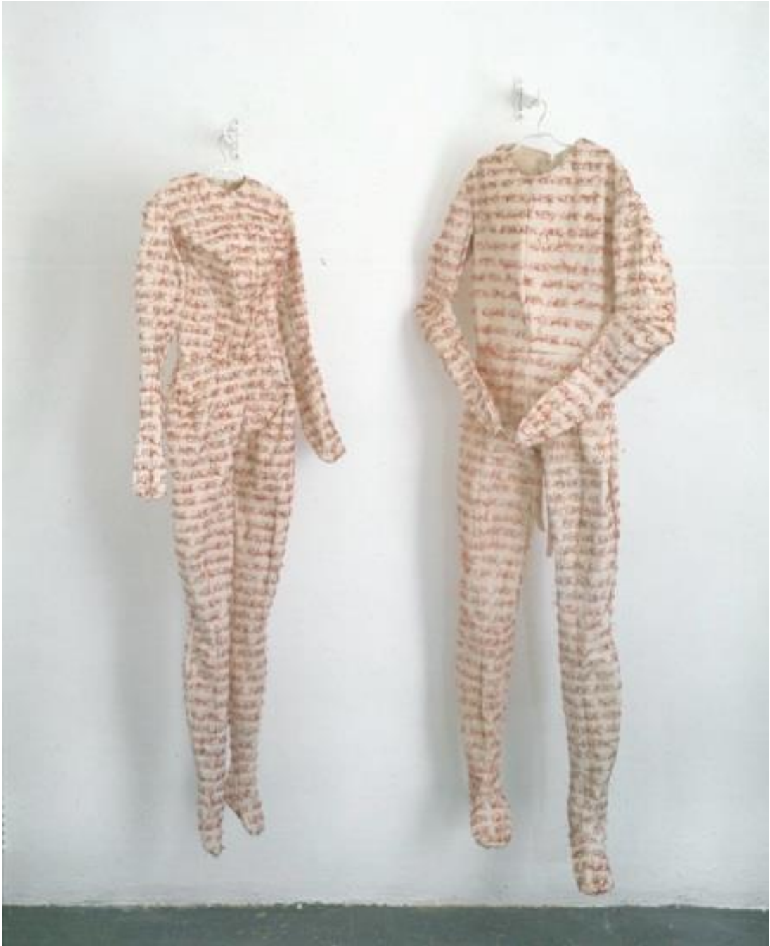
Barbie loves Ken; Ken loves Barbie by Ghada Amer