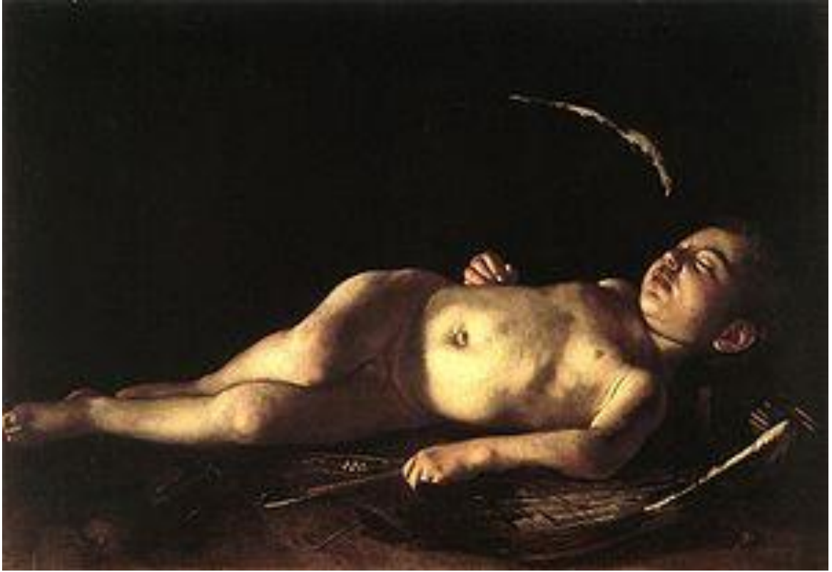
Sleeping Cupid by Caravaggio